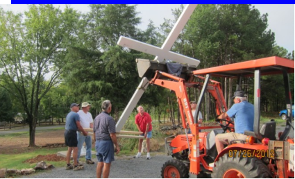
Wood, Don Sass, Bill Thompson

Lift High the Cross! Improvements to Giompoletti Hall and the surrounding grounds have been well publicized in the last couple of years. Two more improvements have been completed the bar room floor. place is a sparkling ce-